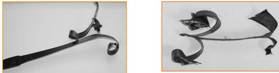
Figure 3. SIP in 25 mm wide HDPE co-extruded texture geomembrane specimens in single and multiple failure planes.

Separation in plane (SIP) of textured HDPE geomembranes is typically observed as a result of destructive seam peel testing on the 25 mm uniform strip specimens. The separation is an internal failure/peeling of the geomembrane and may travel within the sheet for a considerable distance (Figure 2). The issue of separation in plane failure within HDPE geomembranes was first discussed in 2001 (Smith, 2001) and has since been given increasing attention. Table 1 summarizes the documented observations and conclusions regarding SIP to date.